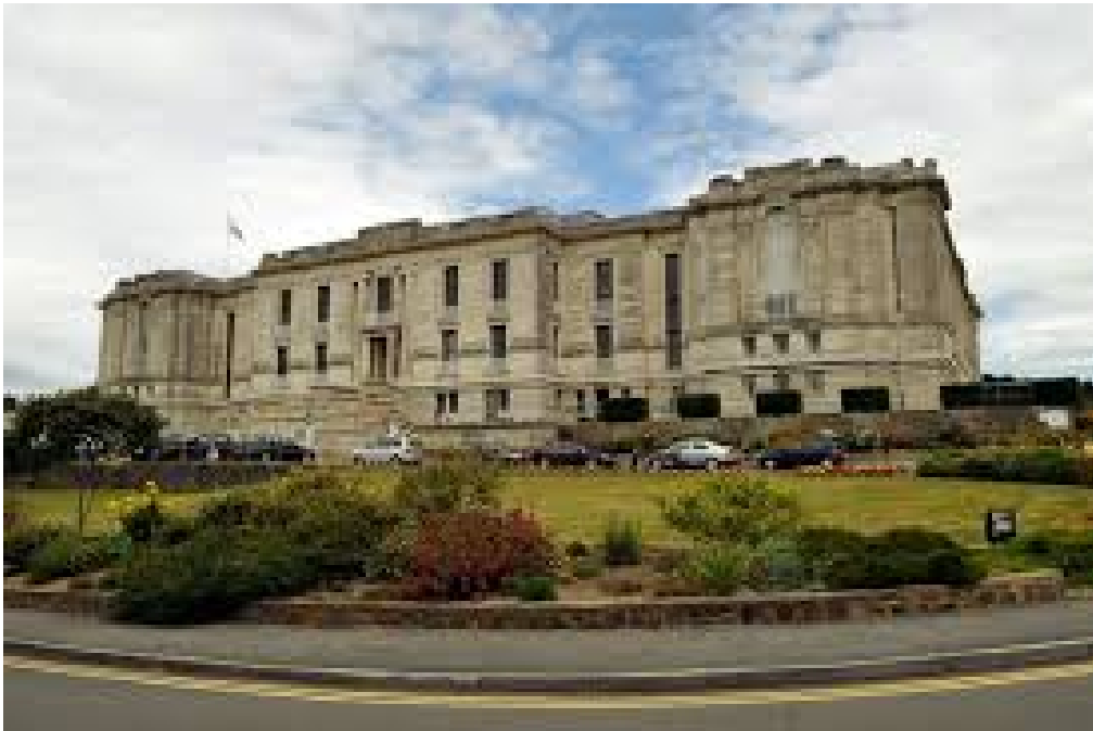
National Library Wales